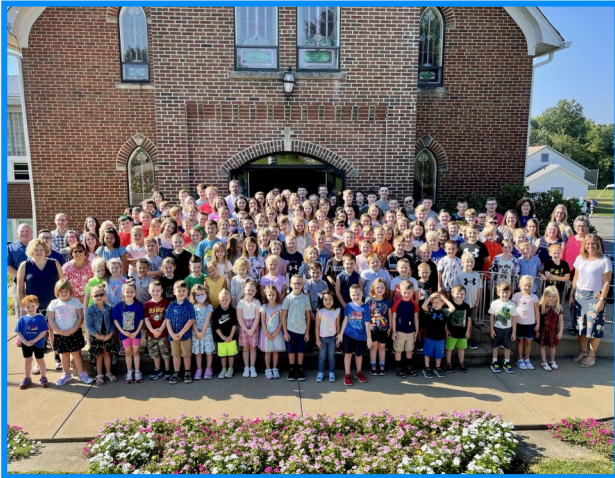
First Day of School 2022

We thank you for your prayers for our school and for your gift to the Annual Fund, whether by check or by online donation at: www.school.stlukecabot.org .